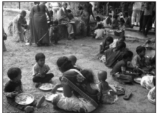
Annadanam in progress for mothers and children