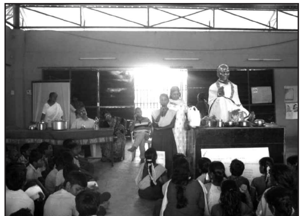
Oratorical contest on importance of Breast Feeding