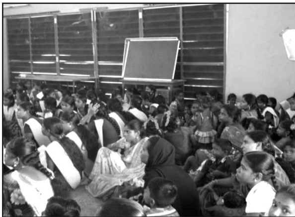
A section of students and mothers attending the Breast Feeding week program