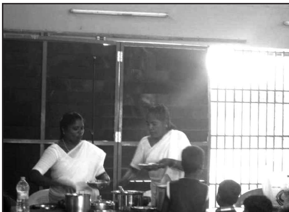
Soup preparation with locally available ingredients by DMS nurses