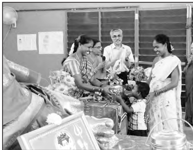
One of the best babies that won prize as 'best breast-fed' baby