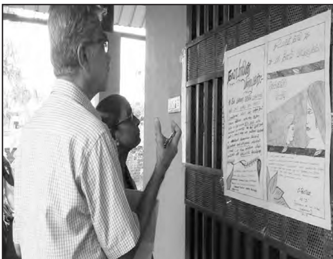
Competition for best Poster