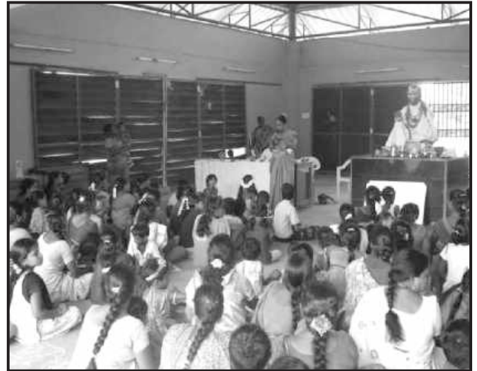
Session in Progress : students and mothers listening to the doctor