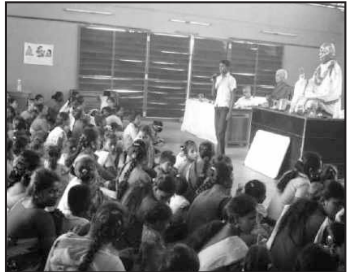
Oratorical Contest on importance of Breast Feeding